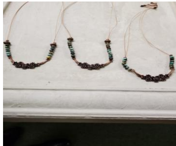
Copper focal pendants