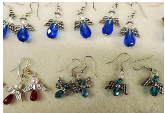
Bead angel earrings