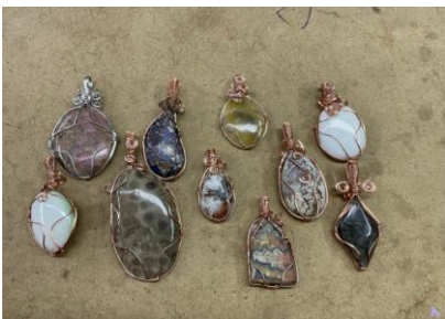
Wire wrapped cabs

CLASSES: 2 nd & 4 th Thursday nights; Here are photos of some of the recent projects